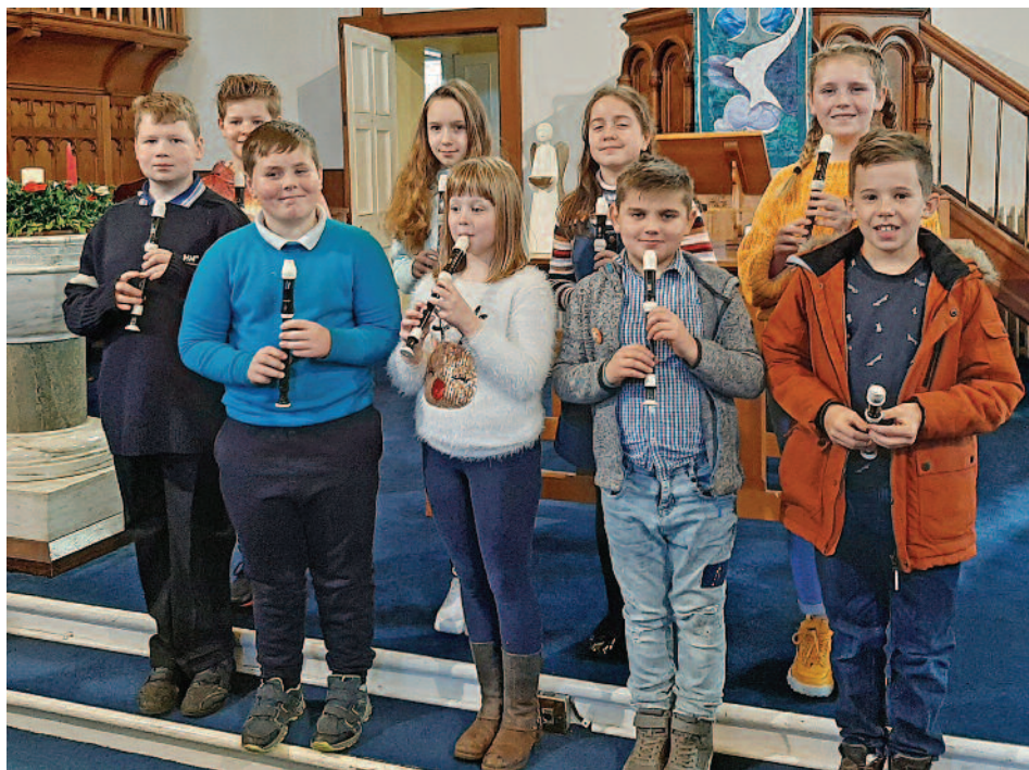
Pictured at an Advent service, the senior group of recorder players were a blessing in our worship. The whole group will be playing again twice in worship in the early part of 2020.