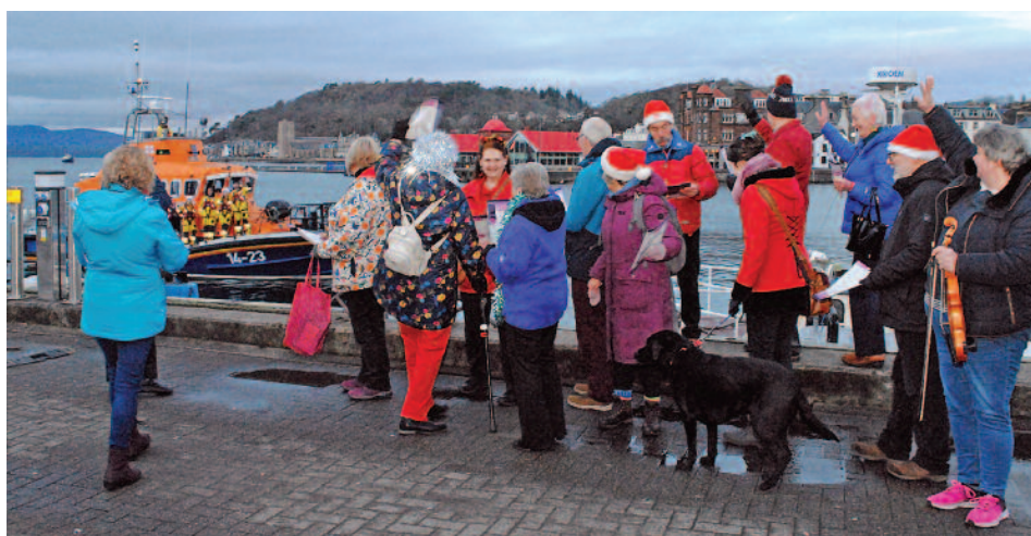
A choir of heavenly angels sing to greet the Oban Lifeboat.