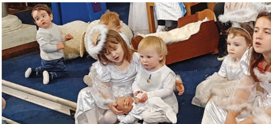
The angels brought news of great joy. They still do!