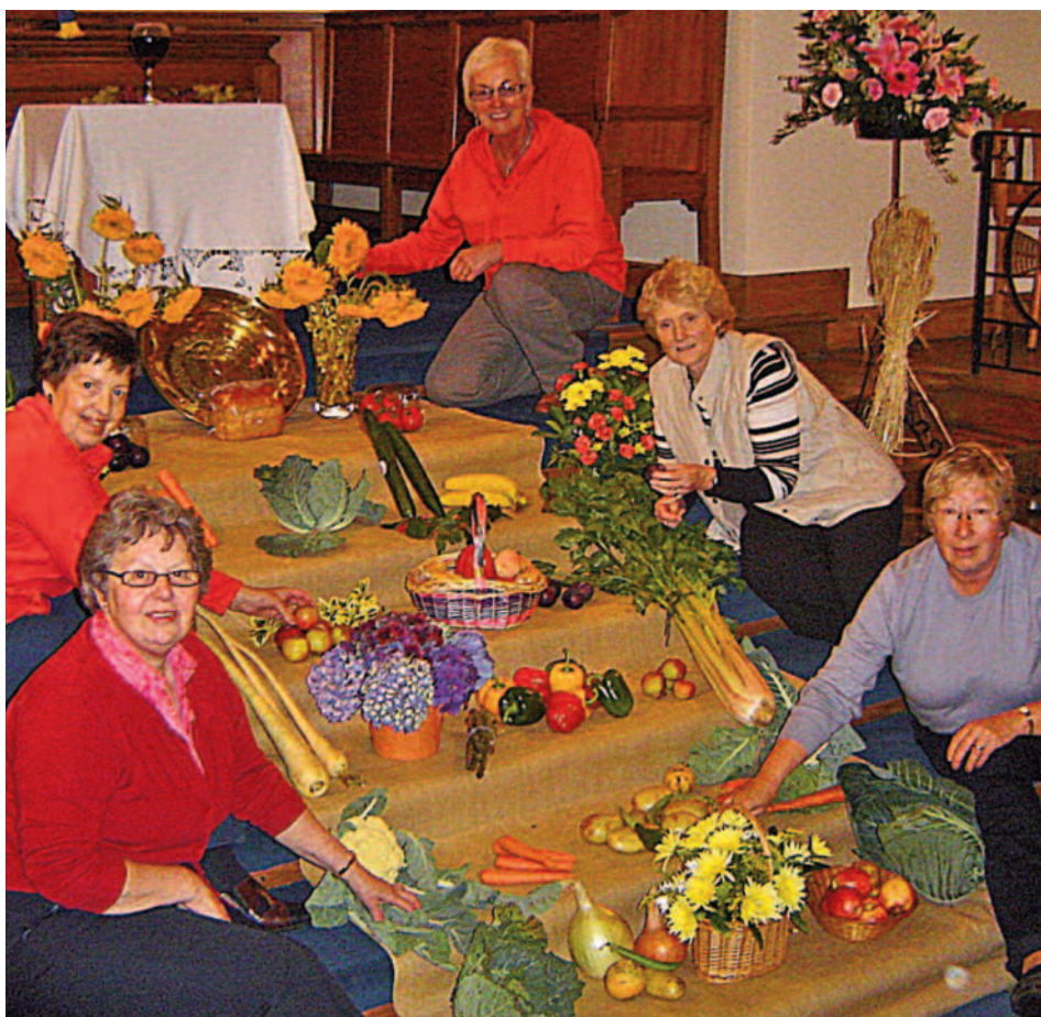
All our churches were appropriately decked out with fruit, vegetables and other goods to commemorate the Harvest Thanksgiving Festival. Photographer Alex Clark was on hand to capture the ladies decorating Esplanade Church.